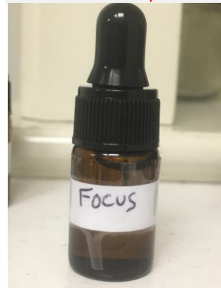
Batch 1 Sample 1